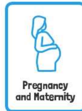
Pregnancy and Maternity