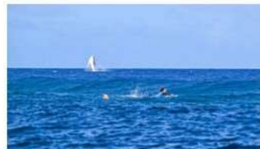
Pictured: A whale photobombing the Tahiti surfing semi-final.

2024 Olympic surfing competition was held, is almost 10,000 miles away from the host city, Paris. The location was chosen for its world-famous waves and amazing scenery. 'This is a magical place, and the waves in Teahupo'o are breathtaking,' said Paris 2024 President, Tony Estanguet, after a visit to the event site. 'Our vision has always been to provide the most spectacular conditions for the surfers and the sport. I have no doubt that Tahiti will deliver on that vision.'