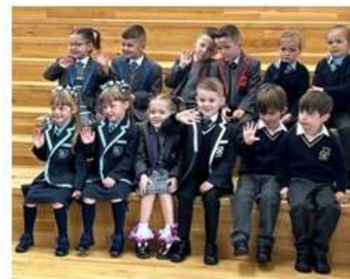
Pictured: Six sets of twins sitting on the 'singing steps' at St Patrick's Primary in Greenock, before starting school.