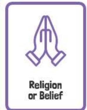
Religion or Belief