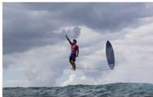
Pictured: Brazil's Gabriel Medin, seeming to levitate above the ocean.