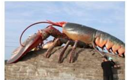
Pictured: A typically-coloured live lobster.

very unique! Instead of being cooked and served as a meal, the restaurant decided to save the orange lobster. They knew it was too special to be eaten! The lobster has been given a new home at a nearby aquarium, where people can visit and see it up close.