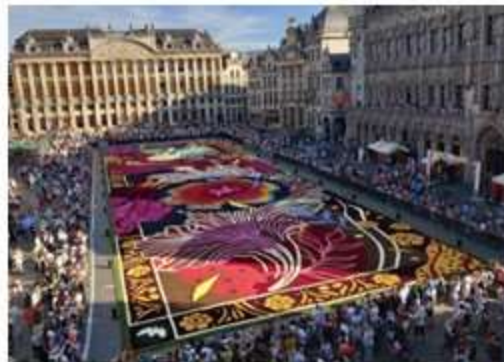
Pictured: The beautiful flower carpet on display in the Grand Place, Brussels.

celebrates with music, lights, and even fireworks at night! The flowers smell wonderful, and the bright colours make the square look like a giant painting. The Brussels Flower Carpet is not only a stunning sight but also a way for people to come together and celebrate the beauty of nature. It's a tradition that makes everyone smile!