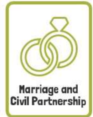
Marriage and Civil Partnership